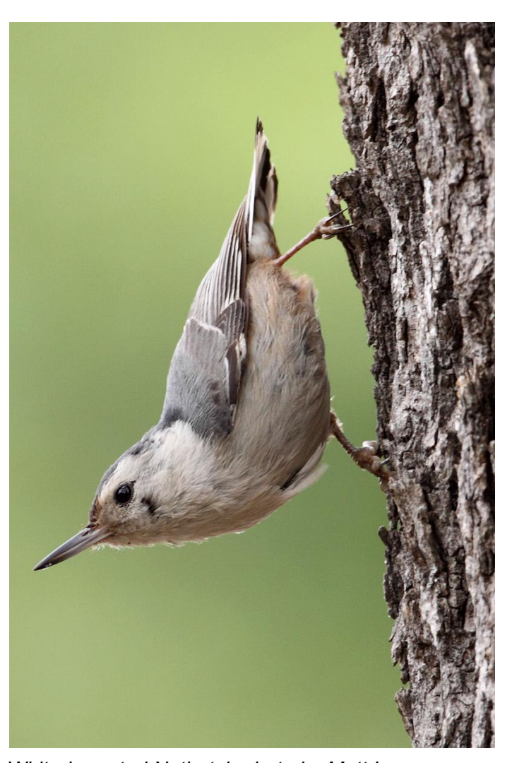
White-breasted Nuthatch

Board and Member meetings may have to be cancelled due to pandemic challenges, so please check our website for the latest scheduling info