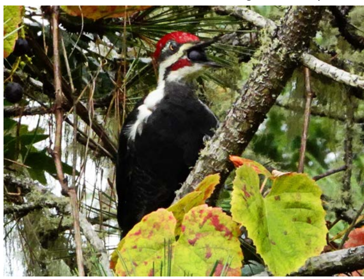
Fig. 3. Pileated Woodpecker consuming CWG fruit. Text and Photos by William Proebsting