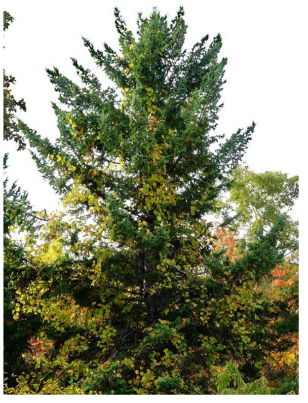
Fig. 1. California Wild Grape growing in Douglas-fir.