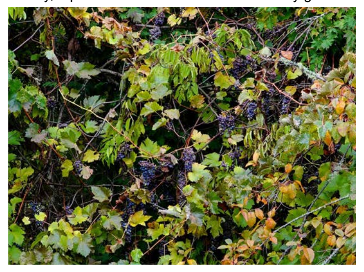
Fig. 2. Ripe fruit of CWG.

California Wild Grape (CWG) is a riparian species that does best with reliable water. Most of my plants are planted above the immediate riparian zone but seem to easily tap into the hyporheic zone below. I have planted some on drier sites and these have done well after I spent a couple of summers providing an occasional big dose of extra water to help them establish. Plant descriptions say that CWG grows to 30-35 feet in height, but mine are generally much larger than that. The plants grow into adjacent trees and spread extensively throughout the canopy (Fig. 1, 2). This adds extra physical structure to the landscape. Clearly, a plant this size isn't suitable for every garden.