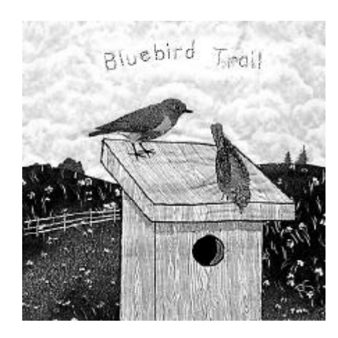
Rita Snyder's square in the CPI quilt