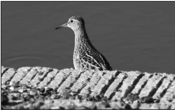
Pectoral Sandpiper

Up to 25 White Pelicans were at Cabell various times from all period (mob) and also at Ankeny much of the period. A Black-crowned Night Heron flew over Finley 8/20 (N Richardson). Green Herons have been somewhat scarce this year, but 1 has been at Thorton Lake in Albany all summer (Tristen) and 1 was at EEW 9/17 (J Geier) and 3 were there 9/23 (Tristen). 2 Greater White-fronted Geese were in fields next to Philomath Sewage Treatment Ponds 9/18 (mob) and 29 were at Finley on NAMC (D Robinson). 3 Redheads were at Philomath Ponds (D Robinson, mob). 5 Mountain Quail were seen on NAMC (F Ramsey).