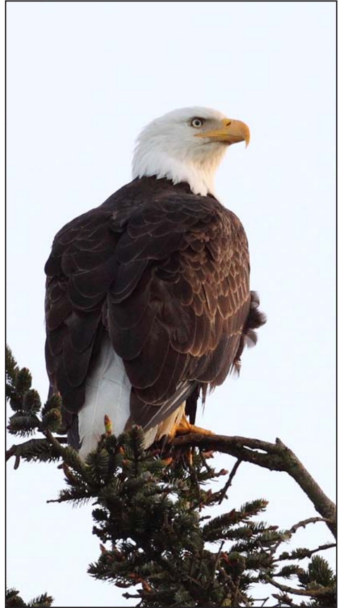
Bald Eagle adult