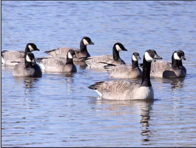
Cackling and Canada Geese

In some positive ways October is more dramatic than springtime migration. From the beginning of the month until the end, there's an almost complete transformation from dry season patterns to the rainy season. The weather in early October is just a bit cooler and wetter, but nearly the same as August. By late in the month, Pacific storms roll in, the daylight pattern has shifted, most leaves have fallen and it already begins to look like winter in the Willamette Valley.