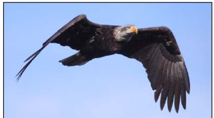
Bald Eagle juvenile