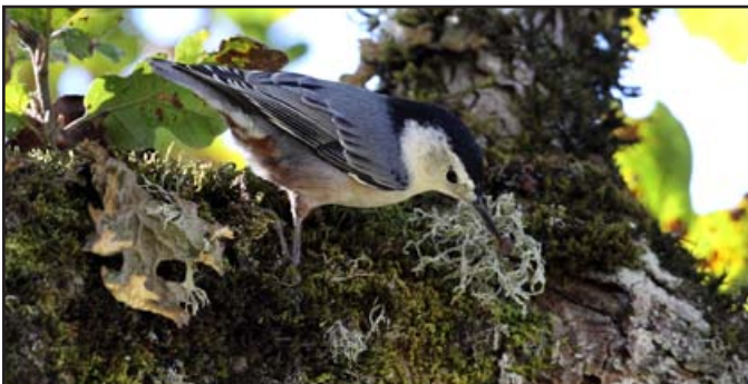
White-breasted Nuthatch

Oct. 9 Second Saturday field trip, 7:30 am Oct. 9 8 th Annual Kids Day for Conservation Oct. 14 Board meeting Oct. 21 General meeting Oct. 23 Hesthavn work party Oct. 28 Article submission deadline for October Chat Oct. 30 Field notes submission deadline for OctoberChat Nov. 13 Second Saturday field trip, 7:30 am