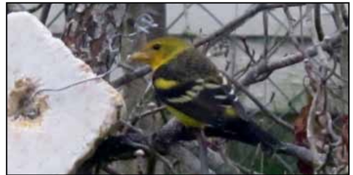
Western Tanager

A presumably overwintering Orange-crowned Warbler was in an apple tree at EEW with other songbirds 2/14 (JG), but by the end of March, it should be joined by migrants from warmer wintering grounds. Yellow-rumped