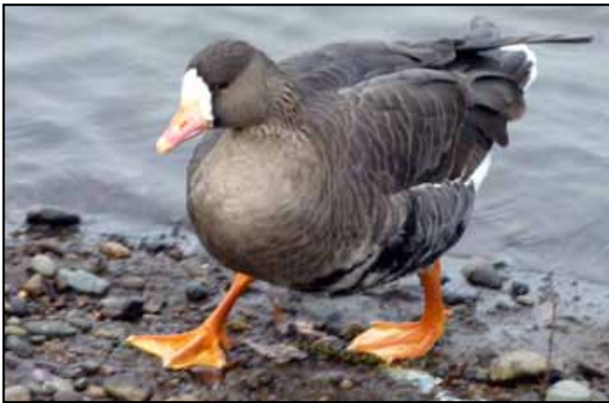
Greater White-fronted Goose