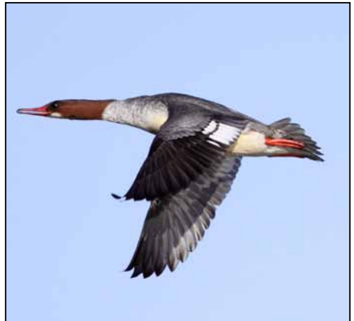
Female Common Merganser

The Chat editor welcomes monthly articles from all members of the Audubon Society of Corvallis. Please submit articles to the Chat editor by the 4th Thursday of the month. Always submit text using Microsoft Word.