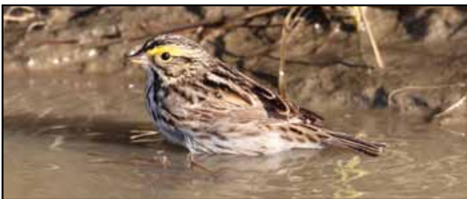
Savannah Sparrow

The Chat is published 10 times a year by the Audubon Society of Corvallis, PO Box 148, Corvallis OR 97339. Annual ASC memberships are $25 for an individual, $35 for a family, $15 for a student. Chat-only subscriptions (email delivery only) are $15.