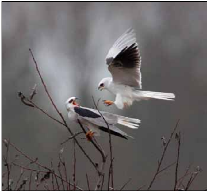
White-tailed Kites mating.