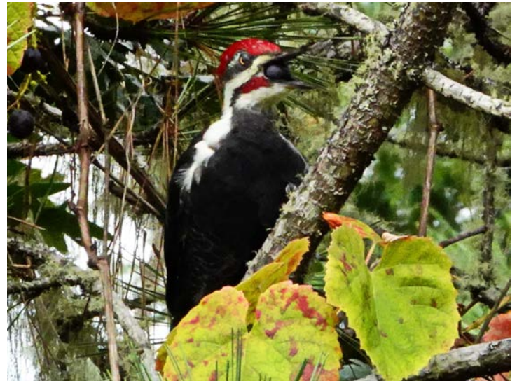
Fig. 3. Pileated Woodpecker consuming CWG fruit.