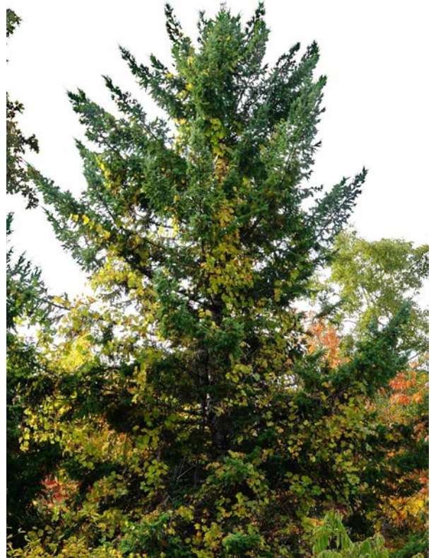
Fig. 1. California Wild Grape growing in Douglas-fir.