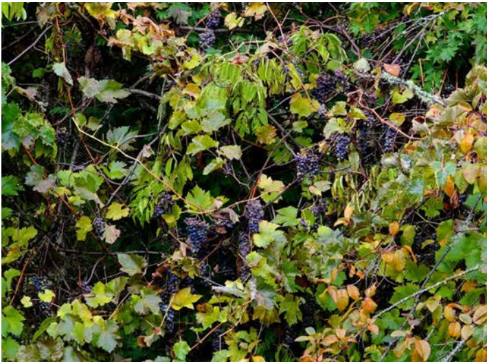
Fig. 2. Ripe fruit of CWG.

California Wild Grape (CWG) is a riparian species that does best with reliable water. Most of my plants are planted above the immediate riparian zone but seem to easily tap into the hyporheic zone below. I have planted some on drier sites and these have done well after I spent a couple of summers providing an occasional big dose of extra water to help them establish. Plant descriptions say that CWG grows to 30-35 feet in height, but mine are generally much larger than that. The plants grow into adjacent trees and spread extensively throughout the canopy (Fig. 1, 2). This adds extra physical structure to the landscape. Clearly, a plant this size isn't suitable for every garden.