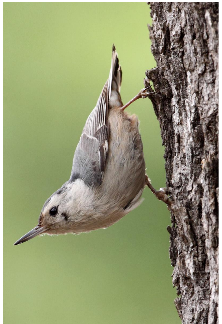
White-breasted Nuthatch

Board and Member meetings may have to be cancelled due to pandemic challenges, so please check our website for the latest scheduling info