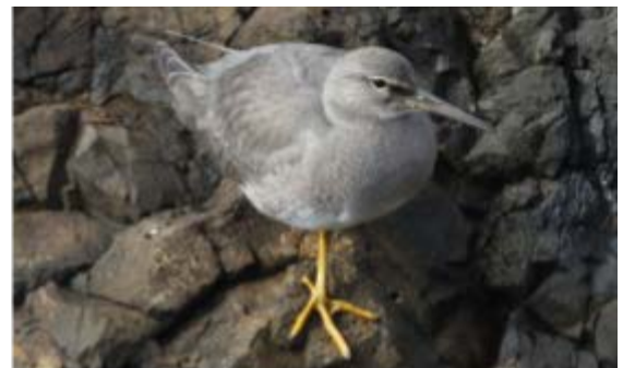
Wandering Tattler