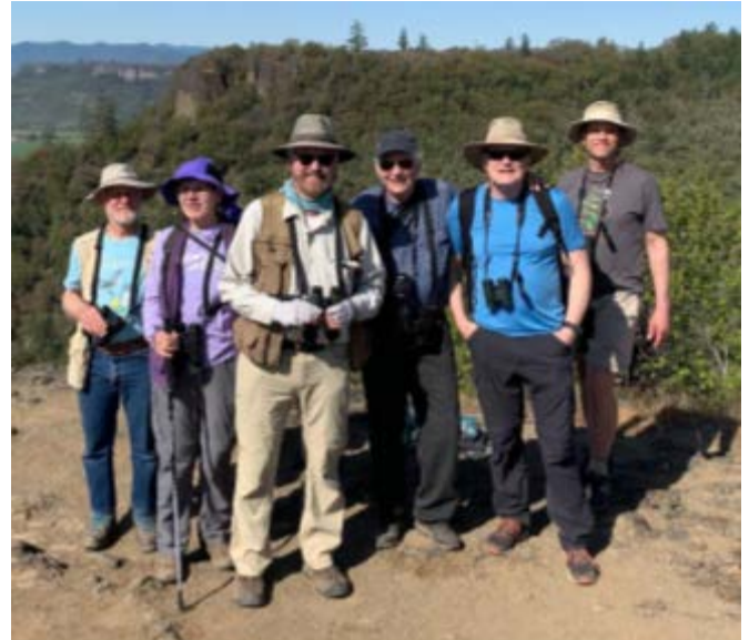
Birders pose at Table Rock.