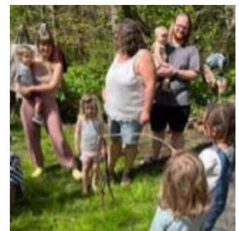
Nonvenomous gopher snake becomes a teaching moment.

The mixing and pouring of concrete for the sign's foundation drew the attention of the children, who were tempted to dip their hands in. Then the remains of a gopher snake were