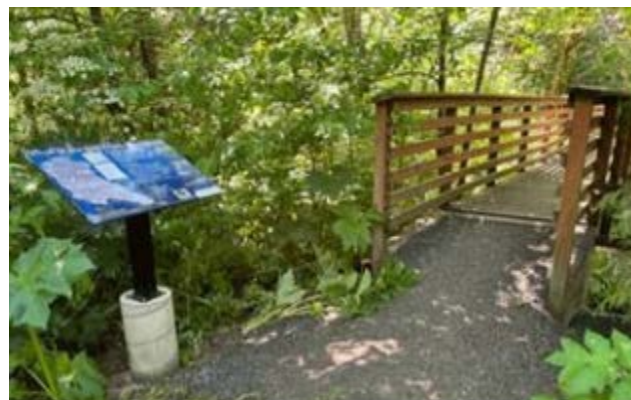
New watershed sign at the east end of the Oak Creek bridge.