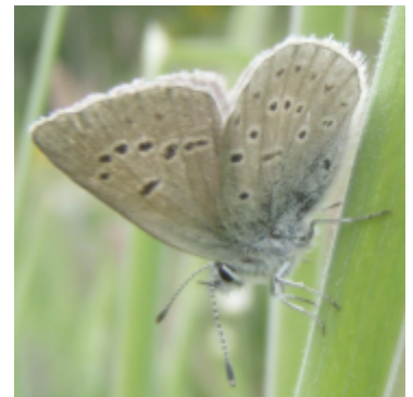
Fender's Blue Butterfly

Doors open at 6:30 PM followed by a business meeting at 7:00 PM. The program begins at 7:30 PM and lasts about an hour.