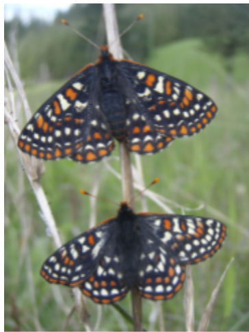
Taylor's Checkerspot Butterflies