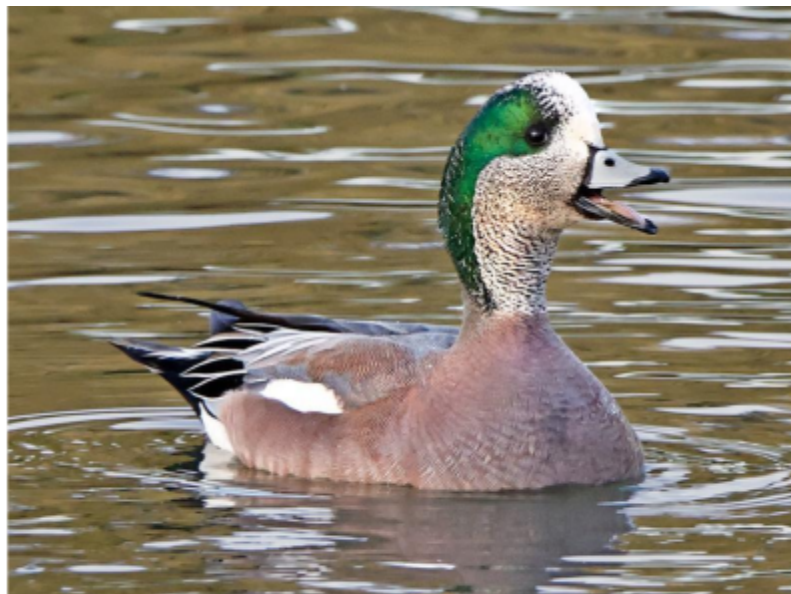
American Wigeon