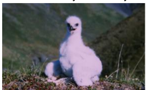
Eagle nestling

It's not too early to select your memorable photos for the MWBA/ASC member slide show!