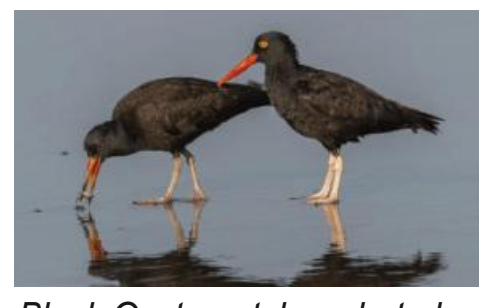
Black Oystercatcher

send 10-20 digital images. We have an hour total for the presentations. So, if we have lots of entrants, you can talk faster as you describe your photos!