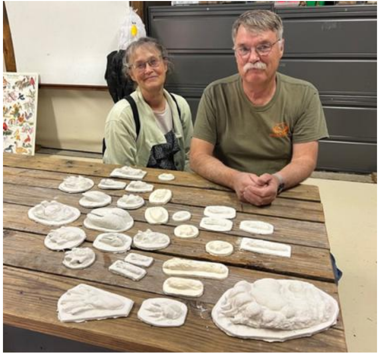
Plaster track casts donated by the Browns